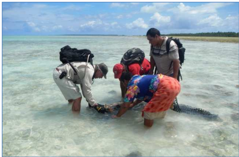
2012: Quick Reaction Force trains Kiribati police officers to remove UXO from Butaritari Reef.