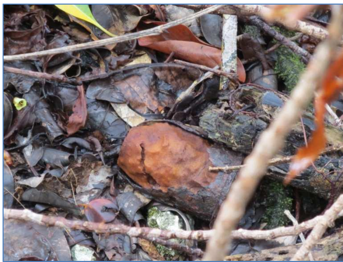
Deteriorating UXO on Peleliu.