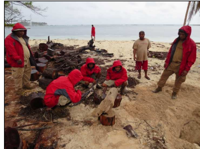
Cleared Ground Demining team inspects a Japanese aerial bomb on Peleliu, Palau.