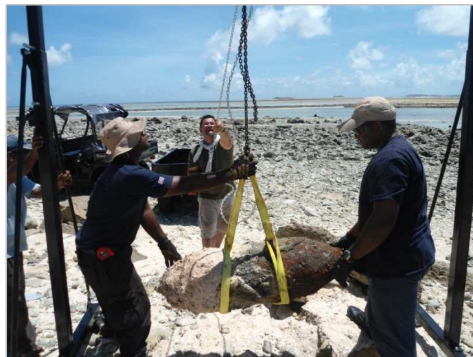
2013: RSIPF and Golden West remove UXO from Maleolap Atoll in the Marshall Islands.