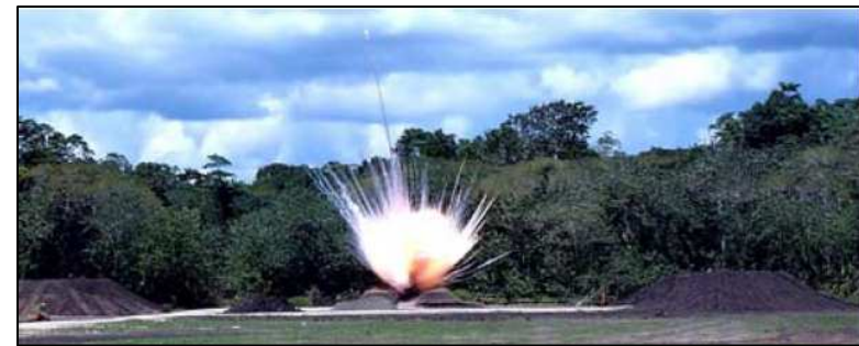
Demolition operations on Guadalcanal, Solomon Islands.